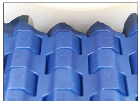
Optimized chain-sprocket engagement