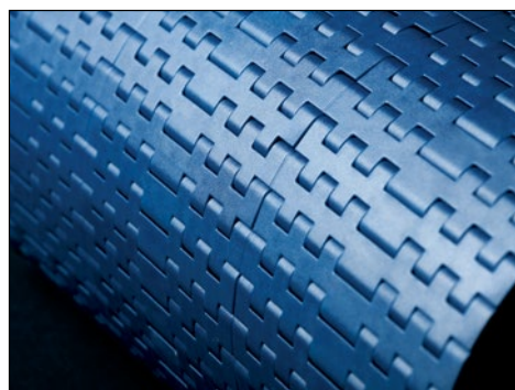
Rexnord 395 Series MatTop Chain (top view)

This prevents the chain from jumping on the teeth when light or heavy load is applied in case of high or low tension of the chain around the sprocket.