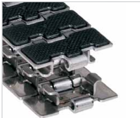
SSR812 TAB K325 RT Series TableTop Chain

Contact your Rexnord representative for pricing. Delivery time will remain the same.